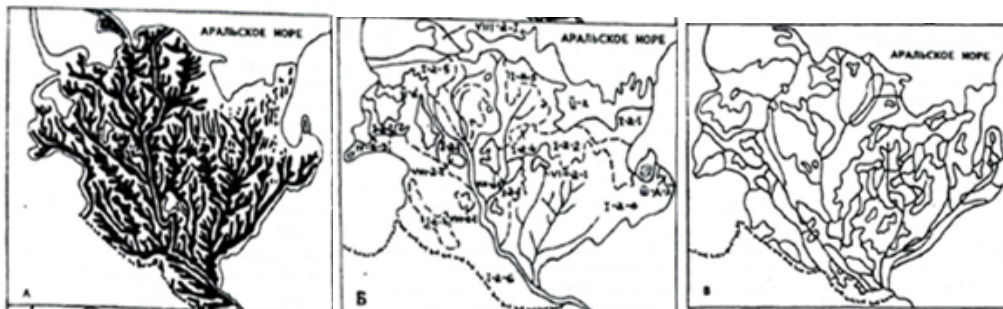
Fig. 1. Comparative assessment of the contour on the maps of the modern delta of the Amu Darya, compiled by different authors:

Idealization makes it easier for a soil scientist, geographer and geologist to study the framework of the structure of a system-forming stream - a geosystem, simplifying it to a geometric model. During idealization, all secondary parameters are discarded, only essential ones that are necessary for geometric analysis remain: points, lines, planes, on the basis of which the axioms are constructed according to the proposal of I.N Stepanoa [9]. The latter form geometrical figures (see Fig. 2, 3), reflecting the natural forms of structures of system-forming flows of small deltas in the first abstract approximations. Abstraction of the topography in the form of straight-line segments (see Fig. 3) creates a branching system: a "topological tree", and from "trees", "topological forest" is built.