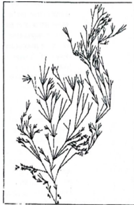
Fig. 3. Abstraction of the relief of the modern Amu Darya delta in the form of segments of straight lines (the second stage of idealization according to Fig. 1.A)