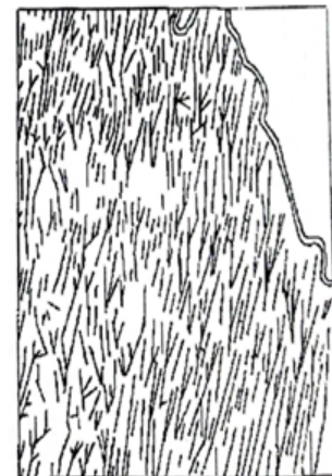
Fig. 6. Idealization of the relief of sandy areas in the form of lines