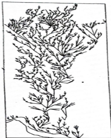
Fig. 4. Idealization of the relief of the Churtambay delta in the form of lines "Topological tree"

Geologists are already using the concept of a parallelepiped (or parallelogram for a plane) when describing the structures of the earth's crust. Soil scientists also compile soil maps based on identifying the ordering of soil areas along a flat parallelogram grid.