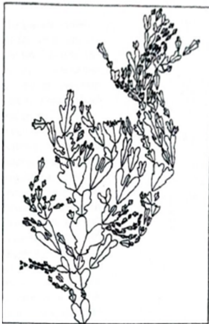
Fig. 2. Graphic display of the blades of shallow deltas of the modern Amu Darya delta (the first stage of idealization according to Fig. 1.A)

The direction of one-way system-forming flows can be simplified to straight line segments. The lines show the main directions of flows on an ideal soil-geological body. As can be seen from Fig. 3, at the points of division they are characterized by different directions. For example, at the initial point A, the streams form two diverging lines at an angle of 35^\circ , which can be explained by the specifics of their natural forces. Stream C2 is more powerful than stream C1. These two streams form systems of streams that differ from each other in the degree and nature of branching. The flows of the C2 geosystem are directed mainly to the north, and the C1 geosystems are directed to the northwest. Apparently, the directions of the system-forming flows can be identified on the maps of the relief plastics, i.e. flow system of Fig. 3 can only be obtained from fig. 1, A or fig. 2, but not from traditional maps (see Fig. 1, B, C). Although the systemic streams are clearly visible on space images, they are not drawn by cartographers.