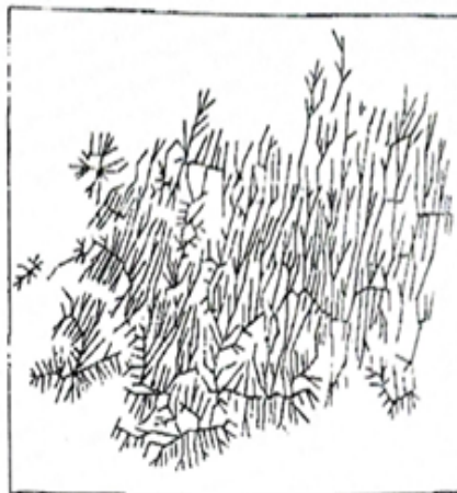
Fig. 5. Idealization of the relief of the western part of the Kuskanaupland in the form of lines