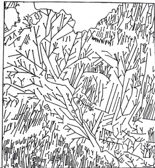
Fig. 7. Relief map of Central Asia (M1: 1,000,000). Elevated elements are shown in the form of a topological forest with dividing points along the "tillering" nodes. Lower reaches of the Amu Darya and adjacent territories. Compiled by I.N.Stepanov

3. Operating in physical geography, geomorphology and soil science with such idealized objects as "topological tree", "topological forest" and an equilateral triangle, etc., we get the opportunity to describe changes in natural-ameliorative conditions within the object.